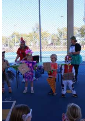
PANNAWONICA SCHOOL Here we kuid the fritre